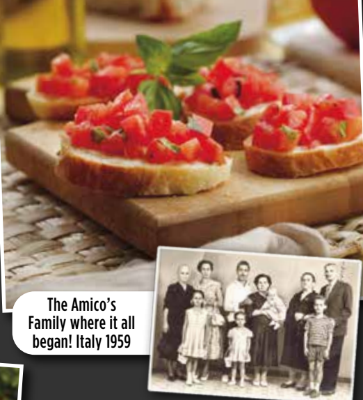
The Amico's Family where it all began! Italy 1959

(10) 16.99 (20) 29.99 (30) 42.99 Choice of Bleu Cheese or Ranch