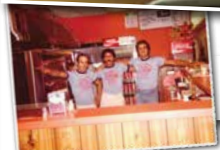
The 1st Amico's Restaurant in the US, 1974

All Mulberry Street Favorite Dishes are served with Pasta & Garlic Rolls Add a Dinner Salad 3.95 Additional Charge For Pasta Sauce Substitution