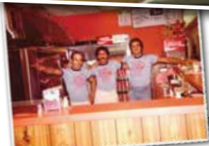
The 1st Amico's Restaurant in the US, 1974

Our Grandmother's Homemade Pasta Feast Italy 1954