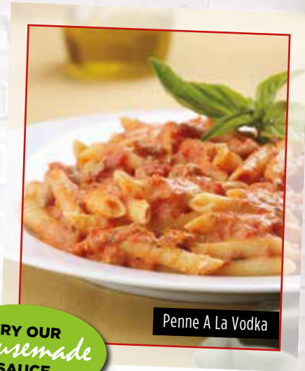
Penne A La Vodka