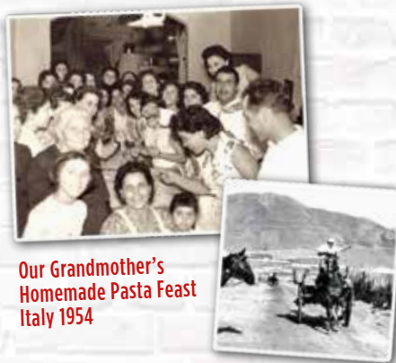
Our Grandmother's Homemade Pasta Feast Italy 1954

All Pasta Dishes are served with Garlic Rolls Add a Dinner Salad 3.25