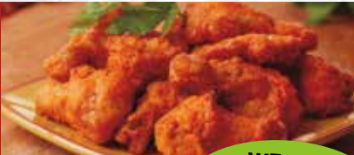
WE USE high quality INGREDIENTS