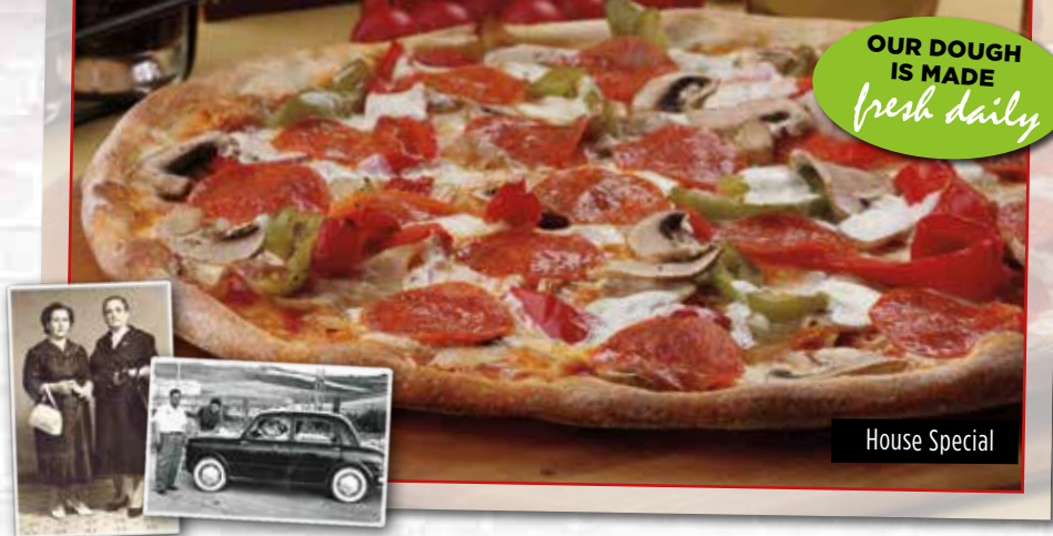
OUR DOUGH IS MADE fresh daily