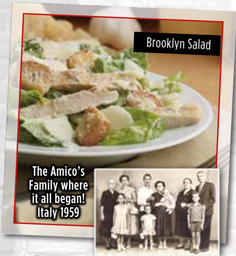
The Amico's Family where it all began! Italy 1959