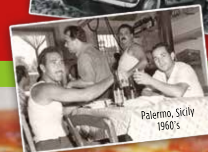
Palermo, Sicily 1960's